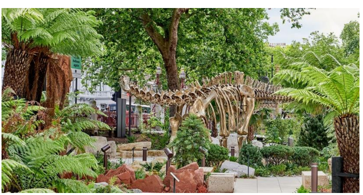
Fern the Diplodocus

1 March (Sat). Caesar's Camp (Hale Plateau) north of Farnham, Surrey, the highest point within the London Basin at 181m (~600ft) and a superb viewpoint. (For this reason, fine weather and excellent visibility is essential for the visit, and if conditions aren't right, the visit will be postponed and may be replaced with an alternative.) Bring binoculars if you have them. On a clear day you can see much of the London Basin from the City of London and Docklands into Berkshire, and the Chobham Ridges, the Chilterns, the North Downs and the North Wessex Downs. The seeing is better after lunch, so suggest