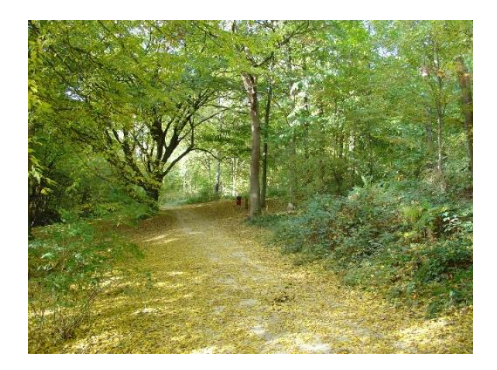
Thorndon Country Park

Thorndon Country Park webpage Map of Thorndon Country Park