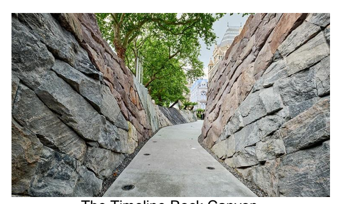
The Timeline Rock Canyon

25 January (Sat). Evolution Garden, Natural History Museum. One way of arriving at the Evolution Garden is to walk along the subway from South Kensington station to emerge into the Evolution Garden by way of the Timeline Rock Canyon . This is constructed of ancient rocks that lead you through geological time, from the oldest rocks in the UK (Lewisian Gneiss and Torridonian Sandstone) and then via 24 other rock types in the garden to the present day. The are many plants to see which can be regarded as living fossils and a replica skeleton of Fern the Diploducus dominating the middle of the garden.