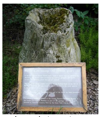
Jurassic tree stump

25 January (Sat). Evolution Garden, Natural History Museum. One way of arriving at the Evolution Garden is to walk along the subway from South Kensington station to emerge into the Evolution Garden by way of the Timeline Rock Canyon . This is constructed of ancient rocks that lead you through geological time, from the oldest rocks in the UK (Lewisian Gneiss and Torridonian Sandstone) and then via 24 other rock types in the garden to the present day. The are many plants to see which can be regarded as living fossils and a replica skeleton of Fern the Diploducus dominating the middle of the garden.