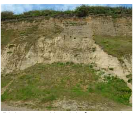
Pleistocene Norwich Crag sands and Westleton Beds gravels, Dunwich