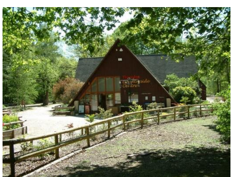
Countryside Centre