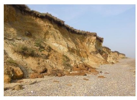
Glacial deposits on Norwich Crag sand, Thorpeness

26 April (Sat). Lesnes Abbey and Woods. London Borough of Bexley; close to Abbey Wood station (Elizabeth Line & Southeastern). This area includes three geological localities: Abbey Wood SSSI*, Chalky Dell RIGS* and the ruins of Lesnes Abbey for its building stones. The area comprises the White Chalk Subgroup overlain by the Palaeocene Thanet Sand Formation, the Eocene Lambeth Group and the Eocene Harwich Formation. The latter is known here for its Blackheath Beds with its distinctive black flint pebbles and the 'Lessness Shell Bed' which is one of the most fossiliferous deposits in the Greater London area providing remains of a diverse mammal assemblage. The deposits are also important for studies in the evolution of bird faunas. There is no London Clay (next in succession above the Harwich Fm.) in the immediate area, the nearest outcrop being between Falconwood and Welling. Lesnes Abbey Wood features a gated sandy enclosure where public fossil hunts occur from time to time. Chalky Dell is a disused quarry featuring the junction between the Chalk and the Thanet Sand, but it is gated off though can be climbed over. Café and toilets near the Abbey.